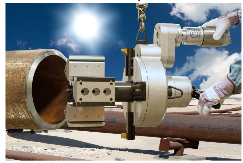
The Dictator can bevel, face and bore heavy wall pipe at any angle at the same time quickly and accurately for perfect fit-up and precision welding.

Bevels heavy wall pipe and is easy to use offering an affordable alternative to specialized machines