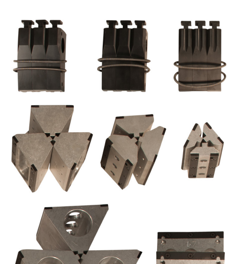
Clamp Ribs Sets D-01, D-02 and D-03 Clamp Pad Sets D-04, D-05, D-06, D-07 and D-08 and Retention Spring D-14