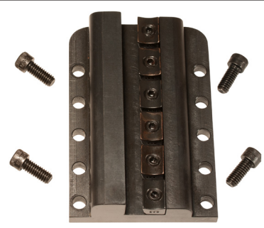
Tool Post and Tool Post screws D-52 and D-55.